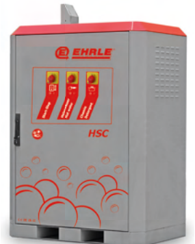
HSC823 Standard HSC1140 Standard HSC1240 Standard