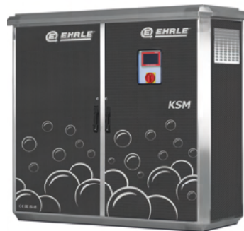
KSM3640 INOX KSM4540 INOX KSM5440 INOX