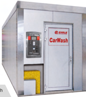
Stainless steel sandwich Technic Container with thermal insulation

Stainless steel sandwich with thermal insulation