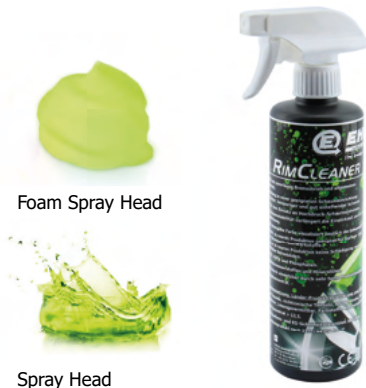
Foam Spray Head