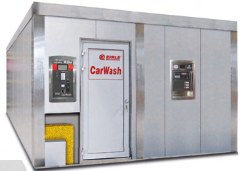
Stainless steel double sandwich Technic Container with thermal insulation

Stainless steel double sandwich with thermal insulation