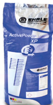
Bag á 20kg