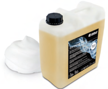
Canister á 10l