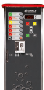
LCE Operating Terminal 1-10 System variants