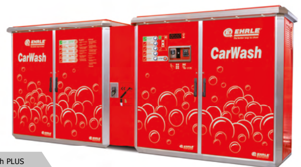
CarWash PLUS 2-4 washing areas