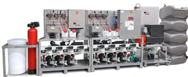
Indoor CompactLine 2-8 washing areas