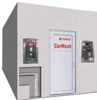
Concrete Precast Technic Container