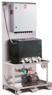
LCE Electric - 37kW LCE Electric - 49kW