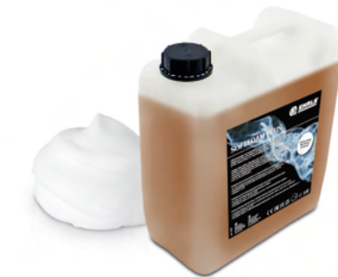
Canister á 10l