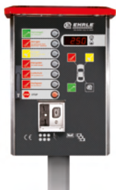
SafePanel Terminal 1-10 System variants