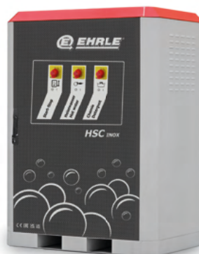
HSC840 INOX 24kW HSC1140 INOX 30kW