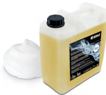
Canister á 10l