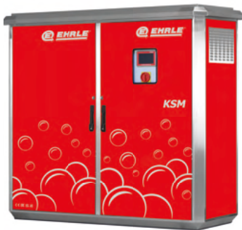
KSM3640 Standard KSM4540 Standard KSM5440 Standard