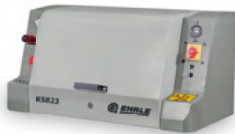
KS823 INOX KS1140 INOX