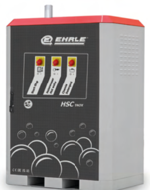
HSC1140 INOX Gas