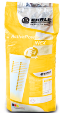
Bag á 20kg