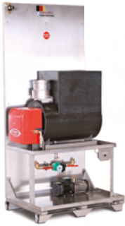
LCE Gas 50 - 85kW