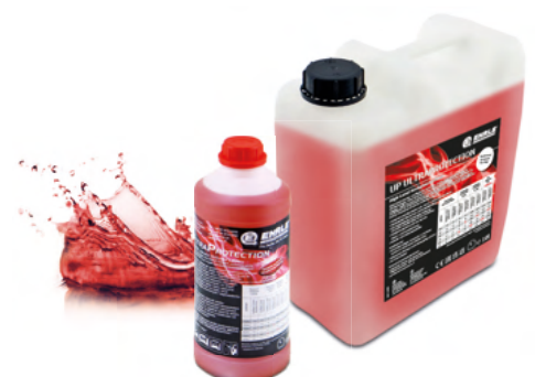
Bottle á 2l