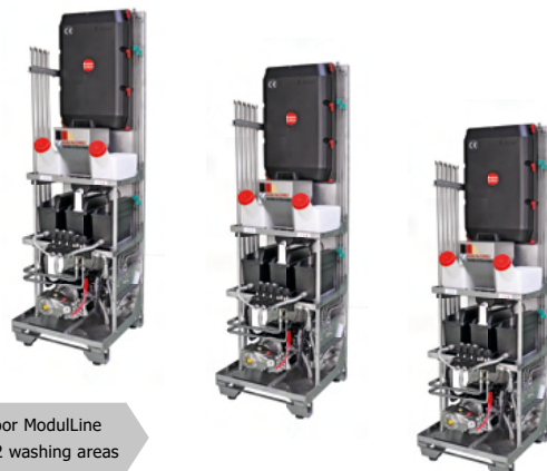
Indoor ModulLine 1-12 washing areas