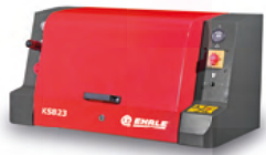
KS823 Standard KS1140 Standard