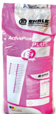
Bag á 20kg