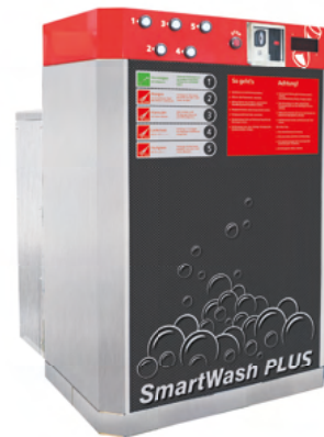
SmartWash PLUS 1 washing area