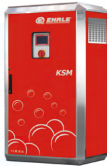
KSM1840 Standard KSM2740 Standard