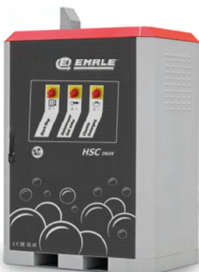
HSC823 INOX HSC1140 INOX HSC1240 INOX