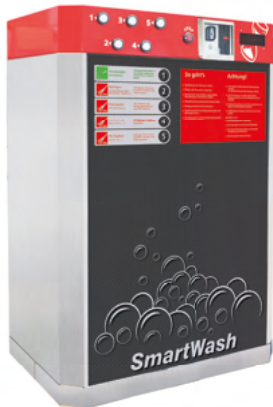
SmartWash Standard 1 washing area