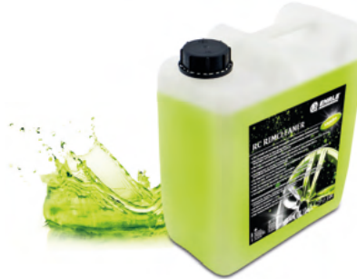
Canister á 10l