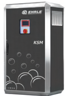
KSM1840 INOX KSM2740 INOX