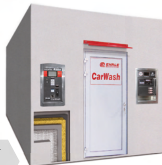
Concrete Precast Tech- nic Container with full thermal insulation

Precast concrete element with full thermal insulation