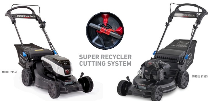
SUPER RECYCLER CUTTING SYSTEM