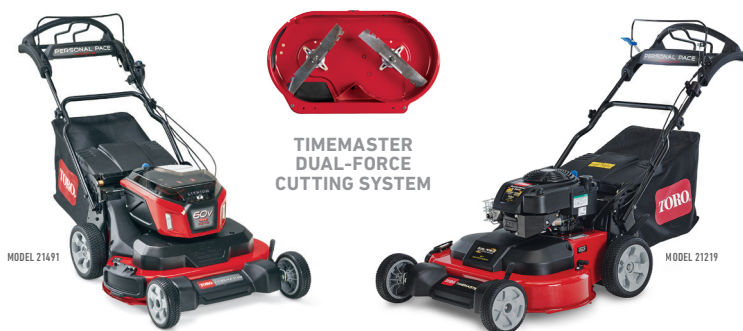
TIMEMASTER DUAL-FORCE CUTTING SYSTEM