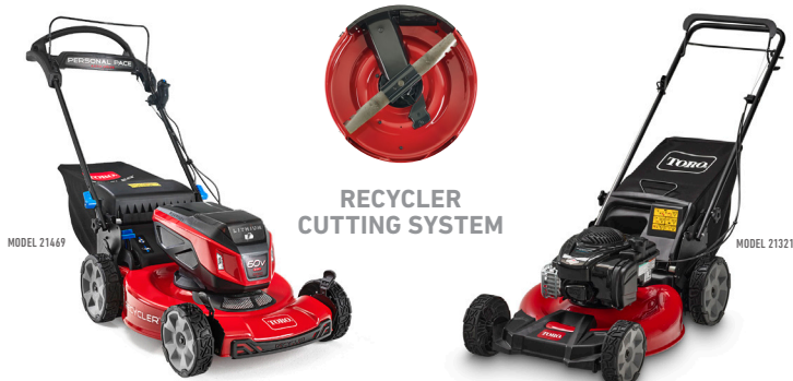
RECYCLER CUTTING SYSTEM